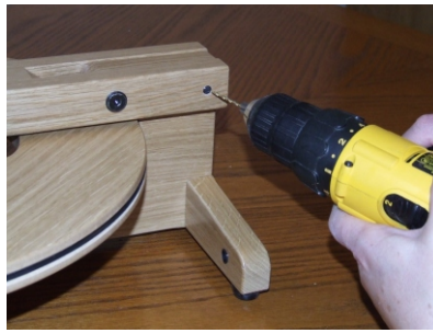
STEP 2: Drill Hole Into Stem