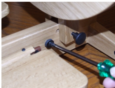
STEP 11: Replace Stopper