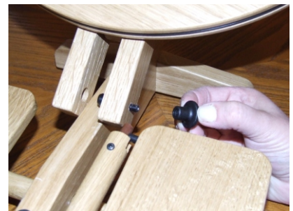
STEP 9: Insert New Pin Knob