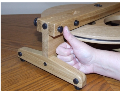
STEP 10: Replace Plug