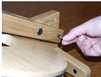
STEP 5: Swing Post to Upright