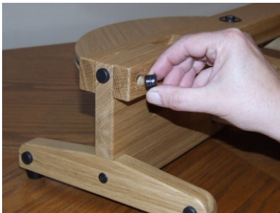
STEP 4: Remove Plug