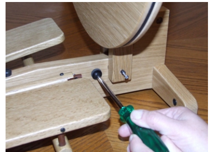
STEP 6: Remove Stopper