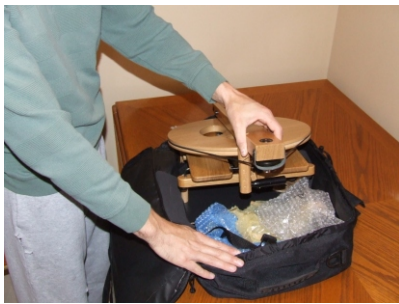
STEP 1: Remove From Bag