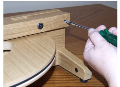
STEP 3: Set Screw Into Stem