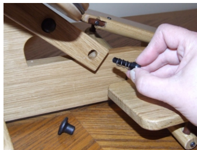
STEP 8: Insert New Pin & Spring