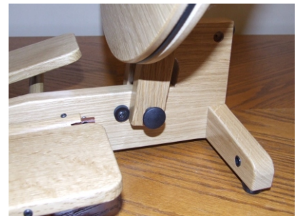
STEP 12: Ensure Tight Fit